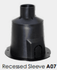
Recessed Sleeve A07